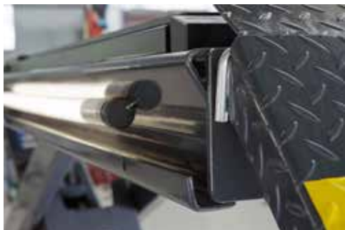
Lighting as an accessory