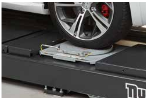
Recessed turning tables for alignment