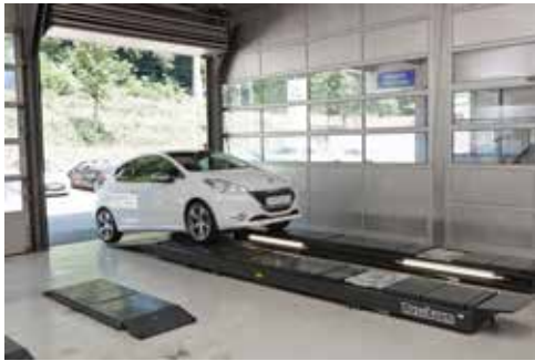
UNI LIFT's low profile allows it to accommodate a wide range of vehicles

The UNI LIFT incorporates the NUSSBAUM NT hydraulic system with precisely machined steel to create the finest alignment scissor lift in the world. This lift is the perfect solution for general repair, wheel alignment, test lanes and car reception areas.