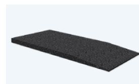
Tuning ramps for low or sports cars, set of 4 units