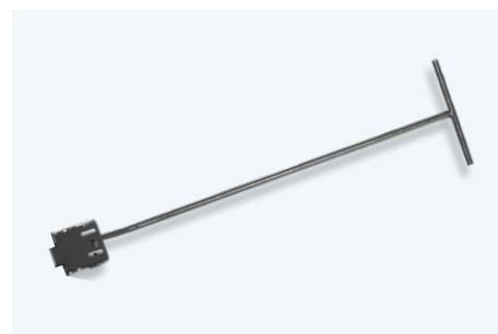
Mobile set to move your lift easily and quickly