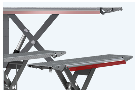
Flaps to increase the length of the ramps

at the bottom of the lift: No wear, no noise.