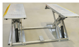
Fire galvanization of scissors and base plate for corrosive environment