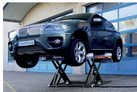
SPRINTER MOBIL 3000 for off-road and SUV vehicles