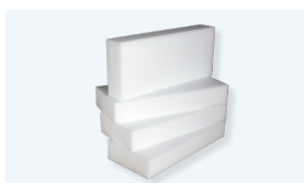
Set of 4 polymer pads 50x150x340 mm (included)